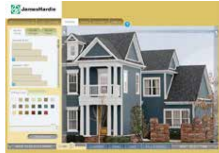
Design your exterior at JamesHardie.com

Choosing a color for a home can be a tough decision. That is why we created an online design tool to help you find a siding color that is just right for your homes. You can design your exterior simply by logging on to JamesHardie.com. The design tool allows you to visualize how each ColorPlus® Technology color, product, texture and exposure will look on your home.