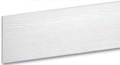
Color Shown: Arctic White