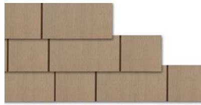
Color Shown: Khaki Brown