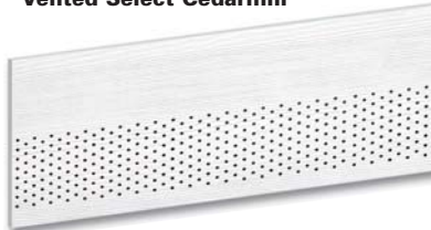
Color Shown: Arctic White