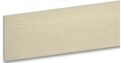
Color Shown: Navajo Beige