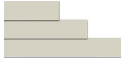
Color Shown: Cobble Stone