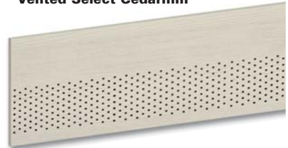
Color Shown: Cobble Stone