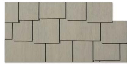
Color Shown: Monterey Taupe

See reverse side for Trim & Soffit Offering.