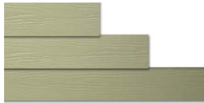
Color Shown: Heathered Moss