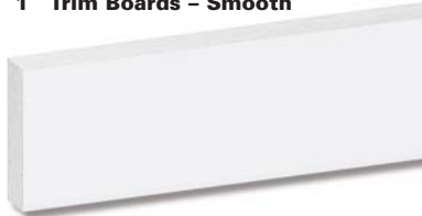
Color Shown: Arctic White