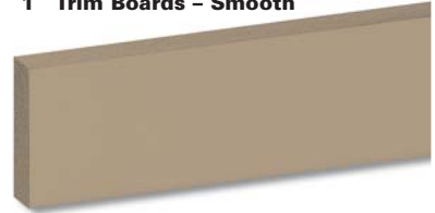
Color Shown: Khaki Brown